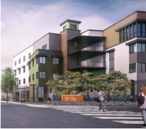
Rendering courtesy of PSL Architects.

With four major construction projects underway, please pardon our dust, traffic, and noise! Rest assured, these projects will result in campus-wide improvements that we will all enjoy. Below is an update on each of these projects and what you can expect to see and hear over the coming months. Please be sure to follow all of our safety precautions. If you have questions or concerns, please stop by our property office and speak with our staff.